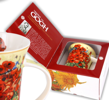
Red Poppies and Daisies 830-8111