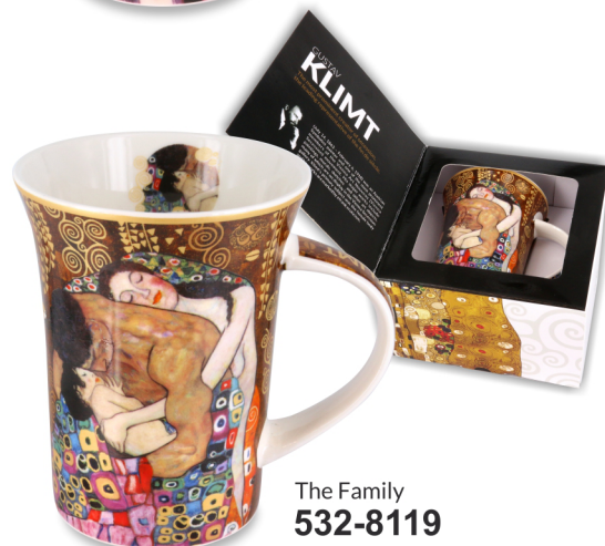
The Family 532-8119