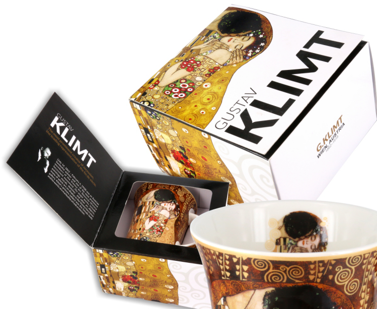
The Kiss 532-8101