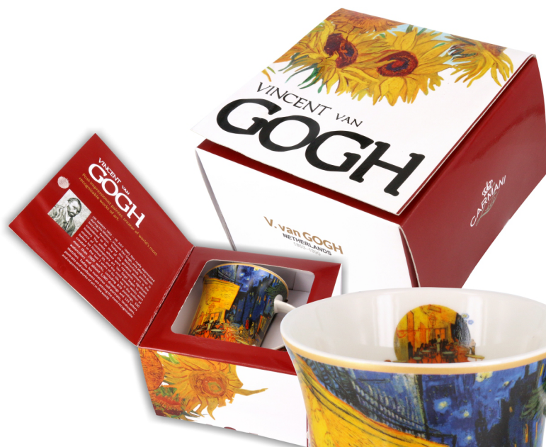
Café Terrace at Night 830-8110